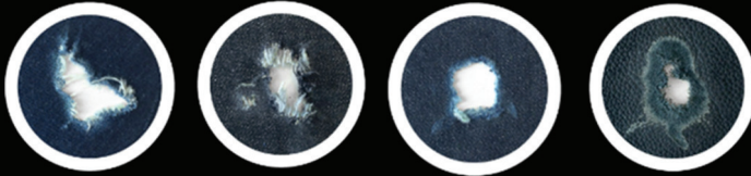
Abrasion resistance test – in seconds