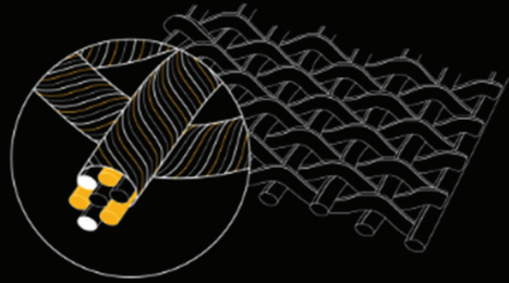
Cordura® Denim – A blend of fibres including 100% cotton, Aramid and Nylon strands.

Cordura® Denim offers much better abrasion resistance to all other versions of denim on the market, including denims with aramid fibres added to the material. Only leather offers more abrasion resistance.