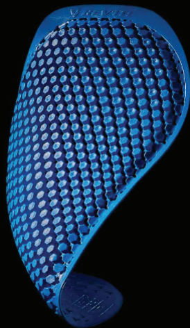
SEESMART™ knee protector